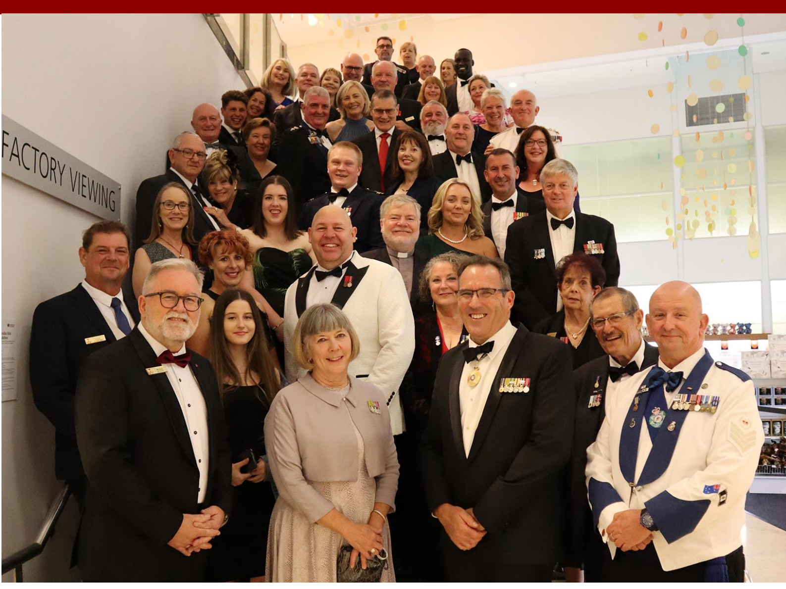
Photo: The Annual Gathering of ABA Members at the 2022 ABA Conference in Canberra

Supporting those who risk their life to save life, property or the environment