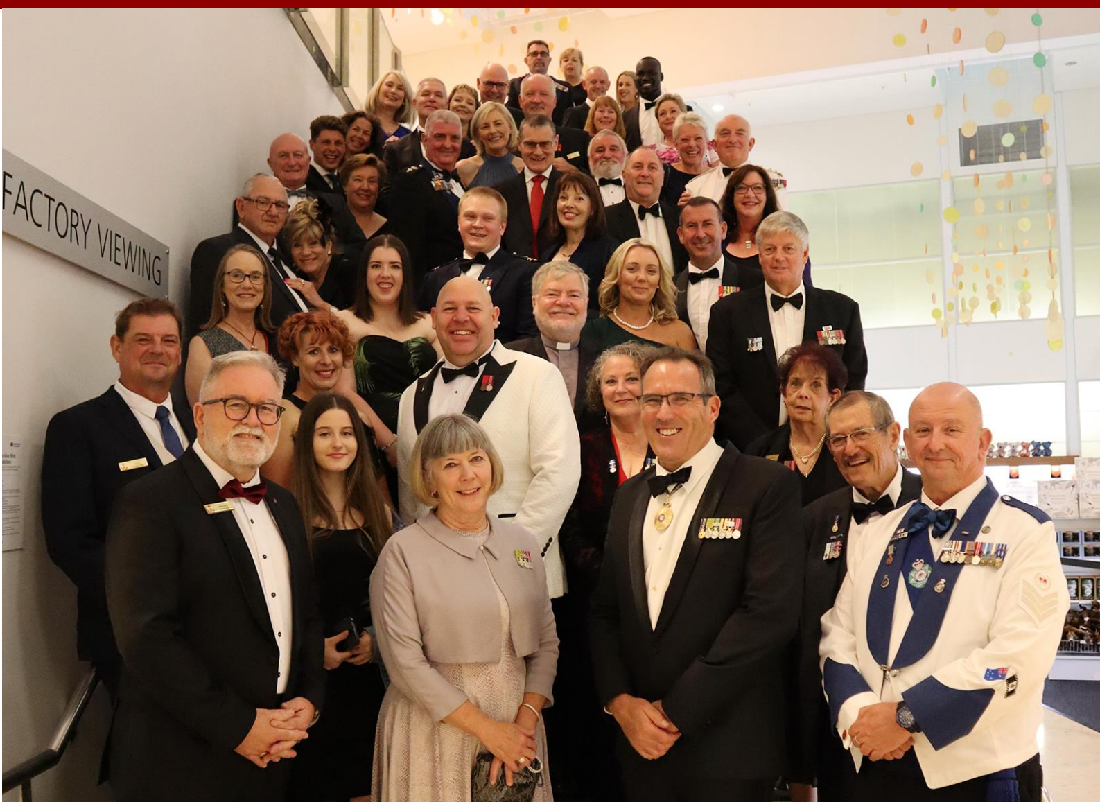
Photo: The Annual Gathering of ABA Members at the 2022 ABA Conference in Canberra

Supporting those who risk their life to save life, property or the environment